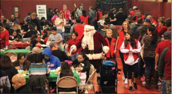
Breakfast with Santa - December 7th